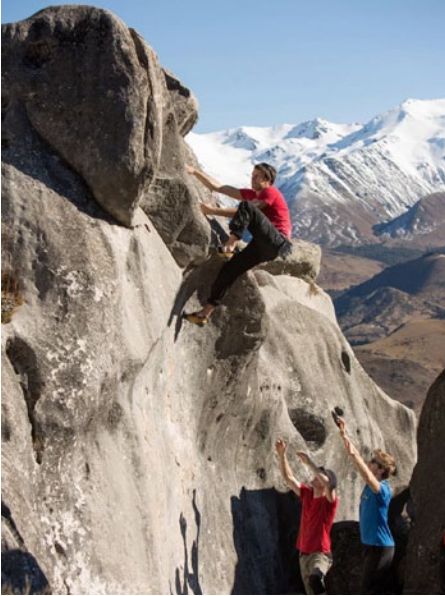
Flock Hill in Winter

'destinations'. If you're in town, Lyttelton Rock and Jane Fonda are worth a visit, especially if you're climbing in the early-to-mid twenties, while Britten is the most accessible with more consistent bolting. And if grade 27 is your idea of a warm-up, the Cave in Redcliffs has climbs up to grade 34, and projects beyond.